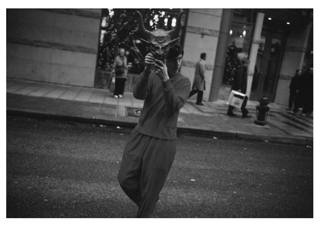
Fig. 9: Allan Sekula, Protester, from Waiting for Tear Gas , 1999–2000, single-channel 35mm slide projection; Museo Universitario Arte Contemporáneo (MUAC), Mexico City, 2018.

For Musil, narrative writing must engage our sense of possibility. It offers a space for reflection not only upon how to think, but also upon how and when to act within contemporary society. In this respect, fiction often serves as a powerful source for imagining the realm of the possible and impossible. Genres of speculative fiction have been a powerful