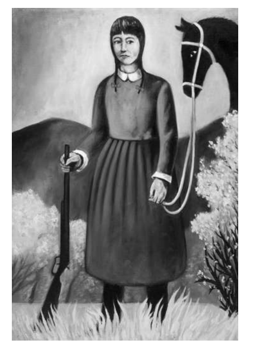
Fig. 7: Mathis Gasser, Mattie Ross , 2010–2011, oil on canvas, 44×30cm.

Indeed, the upright and motionless body manifests as a social sign of insubordination: it is to literally 'stand for' (or against) something, often in opposition to the status quo. The figures of Heroes and Ghosts face the viewer frontally in this defiant, static stance. Gasser captures many of the figures in arrest, often carrying a tool or weapon. The paintings Mattie Ross (Fig. 7) and Asami Yamazaki (Fig. 8) both render female characters in such an arrested moment. Mattie Ross draws from the cover of the first edition of the 1968 Western novel True Grit by Charles Portis. It shows the novel's female protagonist, sporting pigtails and a skirt, holding the reins of her horse in her left hand and clutching the barrel of a rifle in her right, all in a flattened and colorful manner reminiscent of nineteenth-century