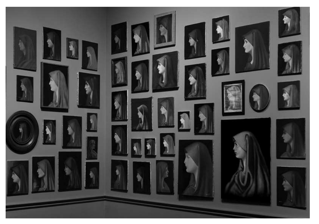
Fig. 6: Detail of Francis Alÿs, Fabiola , installation view, Los Angeles County Museum of Art (LACMA), Los Angeles, 2008–2009.

or when it bears satisfactory resemblance to its source. Thus, the series displays an extraordinary range of styles and degrees of finish. Each image responds to the medium of its prototype. The handmade painted quality points to examples from 'folk' and 'fan-based' art that suggest a popular and more collective rendering of these fictional characters.